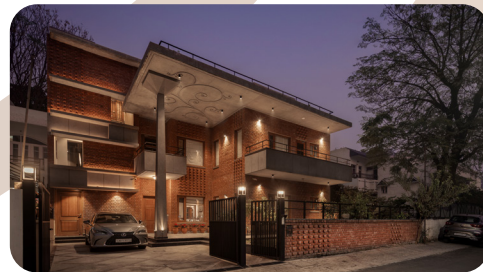
The Brick Banyan