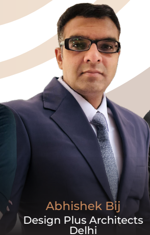
Abhishek Bij Design Plus Architects Delhi